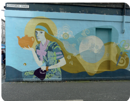
The Gifford Park mural by Kate George, 2015

A mural is a large picture that is usually painted onto a wall, ceiling or other structure.